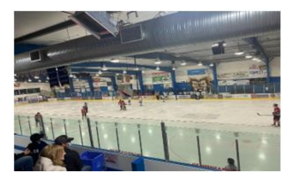
Rockies vs. Ghostriders (Playoff Game 1)

The Rockies kicked off their 2021/2022 playoffs campaign with a big 5-2 win over the Fernie Ghostriders.