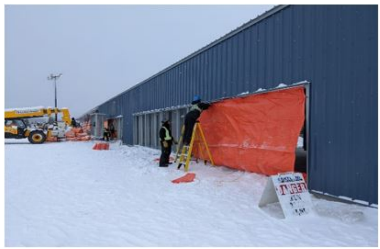
Construction at Mackenzie (1.5 EH/s, 50MW)

Upon completion, the specialized data centers are expected to power an additional ~15,000 Bitmain S19j Pro miners (already secured) generating 1.5 EH/s of incremental hashrate and adding approximately 15 direct full-time local jobs in Mackenzie.