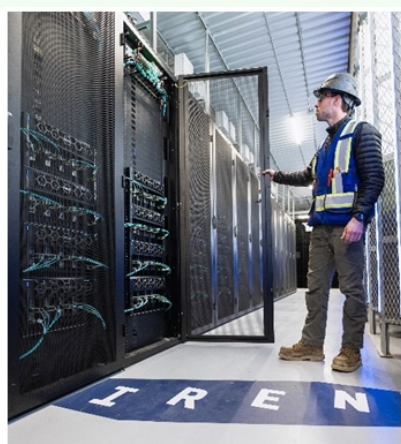
IREN's Prince George NVIDIA H100 cluster