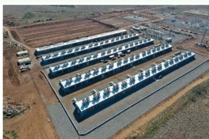
Childress Phase 1 (100 MW) construction progress