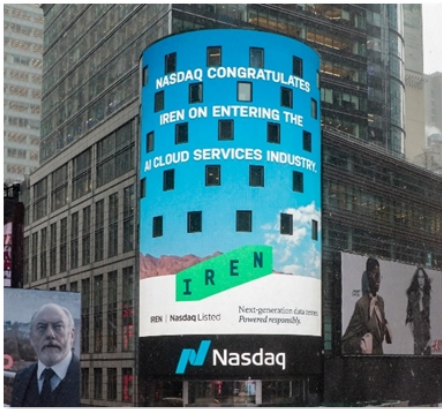
Times Square, February 16, 2024