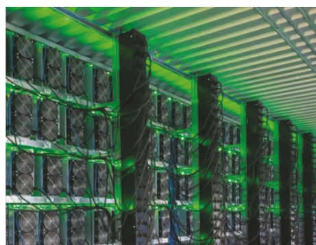
30 MW Canal Flats site