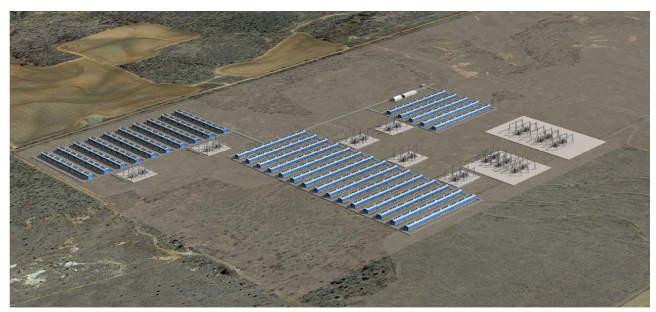
Site plan – Panhandle, Texas (17 EH/s potential<sup>1</sup>, 600MW)

The new site is expected to increase the Company's power capacity from 165MW (4.7 EH/s) to 765MW (~22 EH/s¹) and provides a clear execution plan for the Company's 15 EH/s² of secured miners at 100% owned and operated data center facilities (~10 EH/s expected by early 2023).