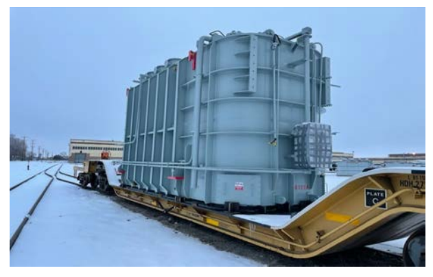
Main power transformer loaded for rail transport to Mackenzie