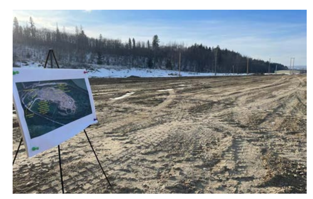
Site grading at Prince George (2.4 EH/s, 85MW)