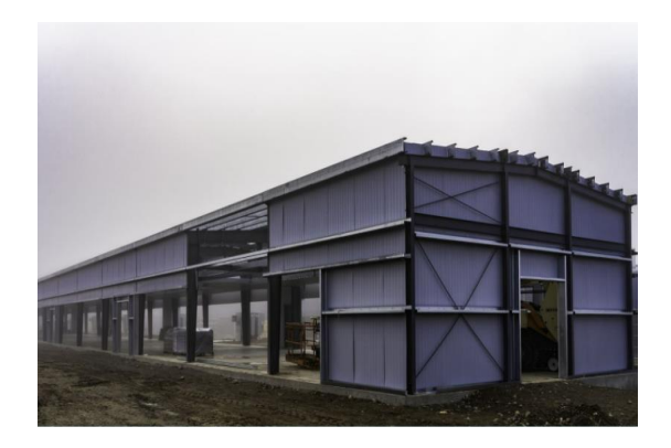
Mackenzie – construction progress at the fourth data center building (20MW)

Internal fit-out of the remaining 10MW of the third data center building (20MW) is complete. Foundations and erection of structural steel for the additional fourth data center building (20MW) is also complete, with internal fit-out ongoing. The substation and on-site electrical distribution works for the capacity increase are also underway. The additional 30MW remains on track for completion by the end of Q4 2022.