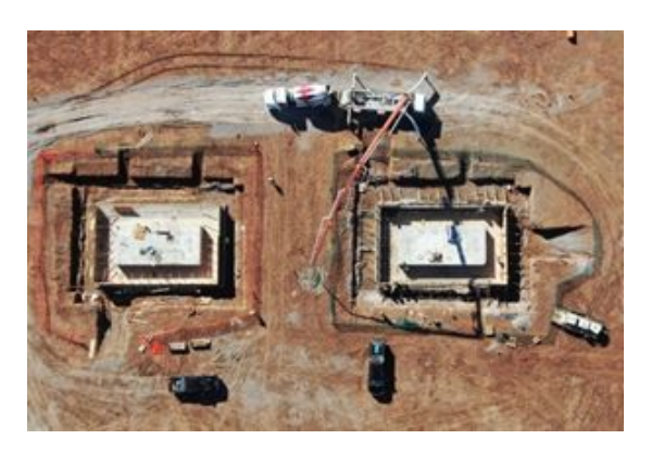
Childress – aerial view of the bulk 600MW substation foundation preparations