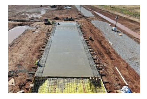
Childress – concrete slab pour at the first data center building (20MW)

Key civil, data center building and substation contractors have mobilized to site and are being managed by a core group of Iris Energy employees based in Childress.