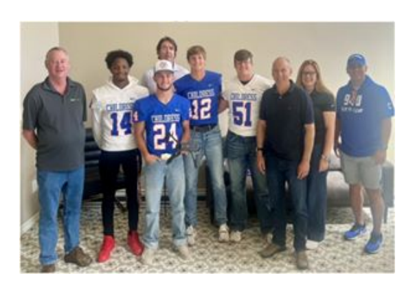
Childress – drone donation to the Childress High School Athletics Department