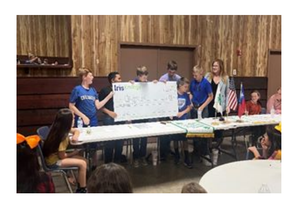
Childress – donation to the 4-H Club

At the Mackenzie site, Iris Energy hosted eight high school students from the College of New Caledonia (CNC) Trade Discovery program. The tour provided insight into the role the electrical trades play in the construction and ongoing operations of our data centers.