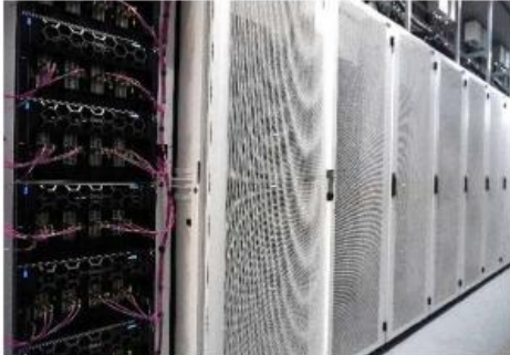
Prince George NVIDIA H200 GPU cluster (November 2024)