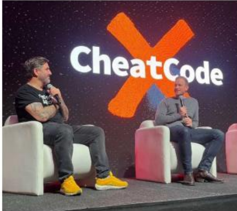
CheatCode Conference, Sydney (October 2024)