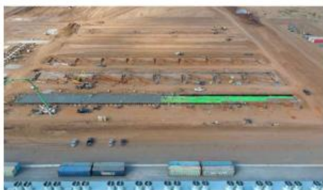
Childress Phase 4 (November 2024)