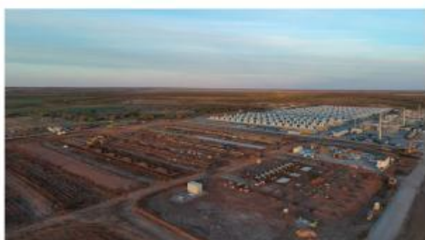
Childress Phases 4 - 5 (Dec-24)