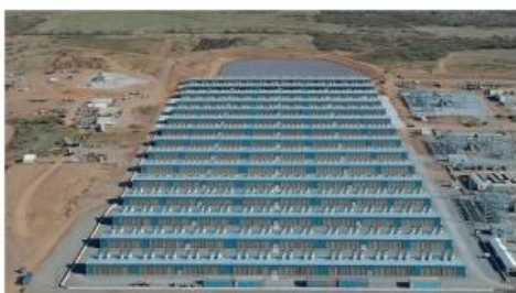
Childress Phases 1 - 3 (Dec-24)