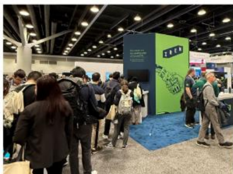
NeurIPS Conference, Vancouver (Dec-24)