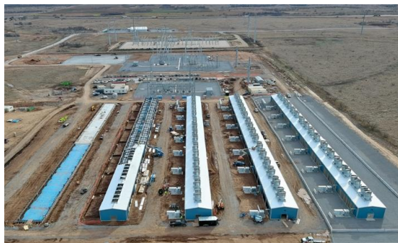
Childress – Phase 1 (100MW) construction progress

The Company's ownership of key infrastructure and significant land holdings provides a rapid and efficient growth pathway, with 600MW of total power capacity immediately available at the site.