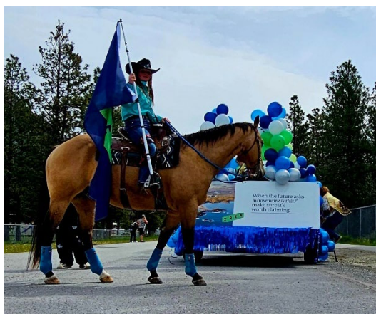
The IREN Canal Flats team was proud to participate in the annual Canal Days celebration and parade