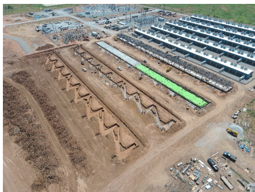
Childress (May 2024)