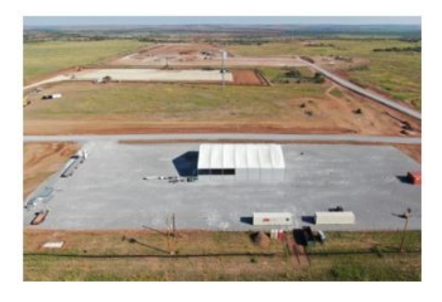
Childress – aerial view of the warehouse, substation and data center areas

Key civil, data center building and substation contractors have mobilized to site and are being managed by a core group of Iris Energy employees based in Childress.