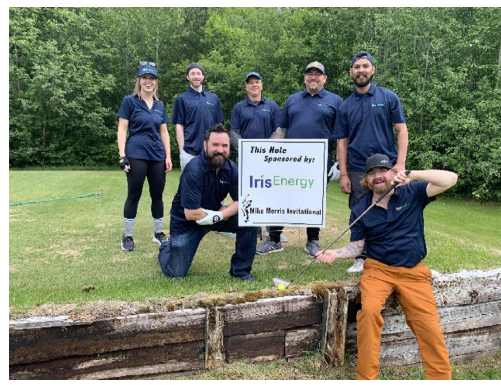
Mackenzie – Mike Morris Golf Tournament