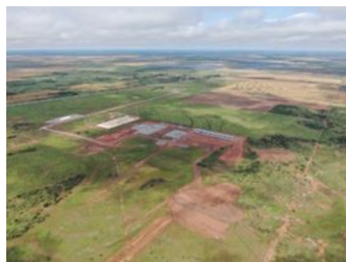
Childress – aerial view of the site