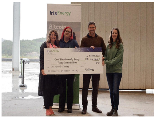
Canal Flats – Community Society