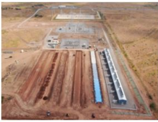
Childress – Phase 1 (100MW) construction progress