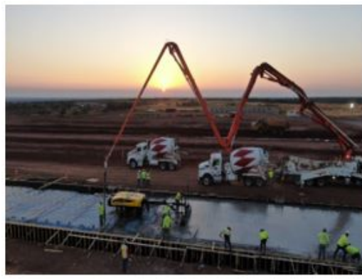
Childress – second data center building foundation