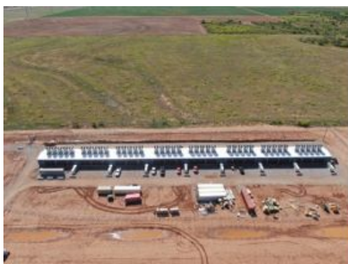
Childress – operational 20MW data center

The Company’s significant upfront investment in key infrastructure also provides a rapid, efficient and near-term growth pathway for the subsequent 500MW of 600MW power capacity at the site.