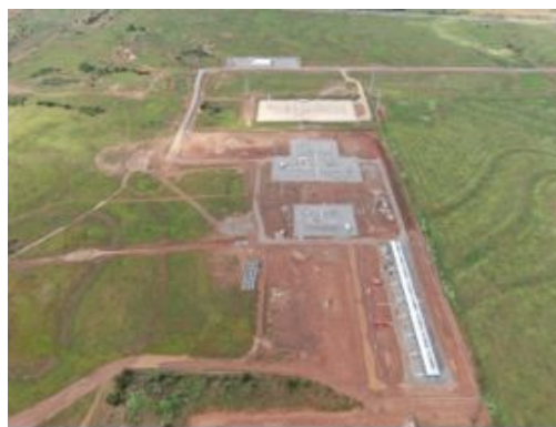
Childress – aerial view of the 600MW site