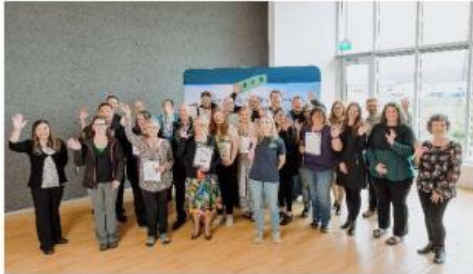
Community Grants Program recipient event (Mackenzie, September 2024)