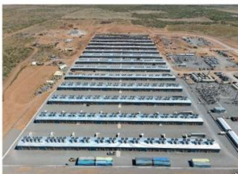
Childress (September 2024)