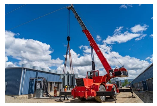
Mackenzie – medium voltage transformer placement

See Mackenzie construction progress video at https://www.youtube.com/watch?v=Ac1F4h0n7xg&t=7s.