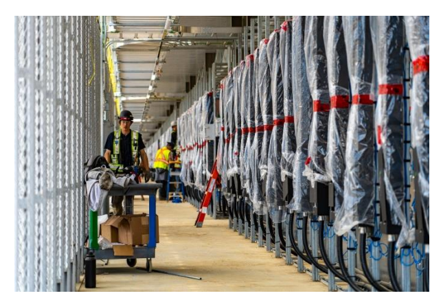
Prince George – PDUs being installed