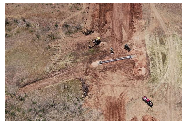
Childress – site civil works ongoing