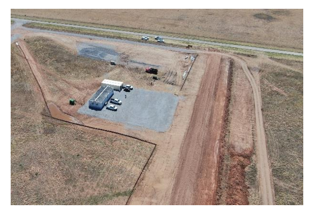
Childress - site construction office and entrance

Procurement and early construction activities continued to progress (all required construction permits are in place). Construction of the access road to the main development area and site civil works are ongoing. Purchase orders have been placed on key long-lead items, including the 345kV step-down transformer, 138kV step-down transformer and associated circuit breakers.