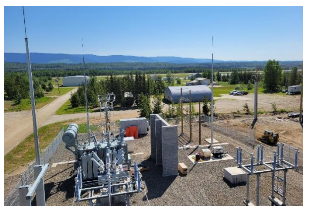
Mackenzie – all major electrical equipment installed in substation