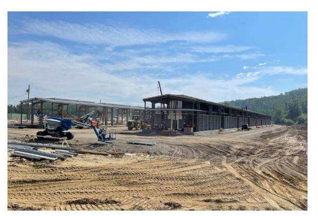
Prince George – data center construction in progress