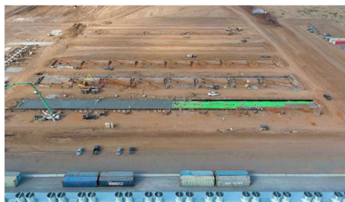
Childress Phase 4 (November 2024)