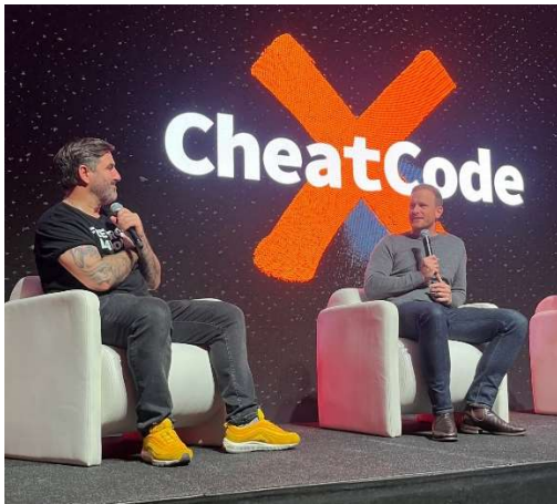
CheatCode Conference, Sydney (October 2024)