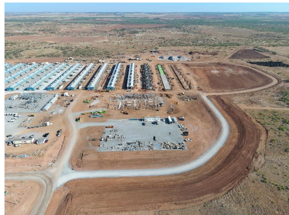
Pathway to industry leadership