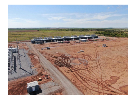
Childress - operational 20MW data center