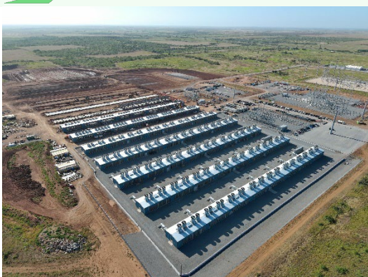
Childress (July 2, 2024)