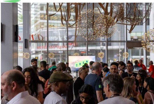
IREN hosted a welcome reception at Collision 2024, North America's fastest-growing tech conference